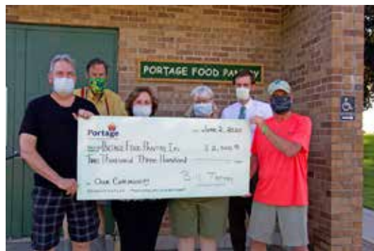
PACF Advisory Committee gives check to Portage Food Pantry, Inc.